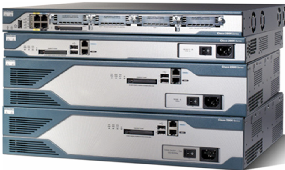
Figure 1. Cisco 2800 Series

Cisco Systems ® , Inc. redefined best-in-class enterprise and small- to- midsize business routing with a new line of integrated services routers that are optimized for the secure, wire-speed delivery of concurrent data, voice, video, and wireless services. Founded on 20 years of leadership and innovation, the Cisco ® 2800 Series of integrated services routers (refer to Figure 1) intelligently embed data, security, voice, and wireless services into a single, resilient system for fast, scalable delivery of mission-critical business applications. The unique integrated systems architecture of the Cisco 2800 Series delivers maximum business agility and investment protection.